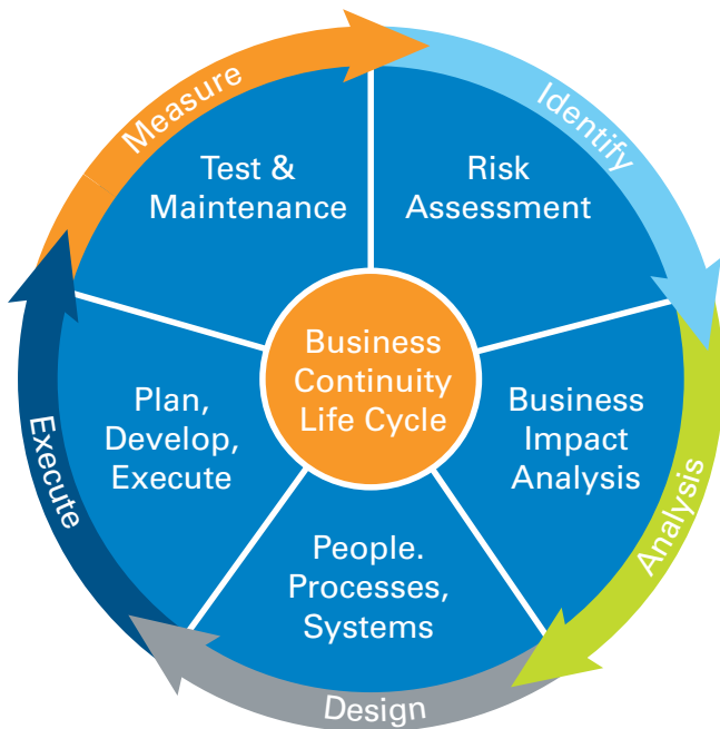
Figure 1: Business Continuity Life Cycle

To optimize the effectiveness of a business continuity plan, effective strategies typically contain both proscriptive and